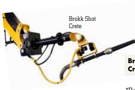
Brokk Shot Crete

*Requires load holding valves with hose burst function Requires two extra hydraulic functions